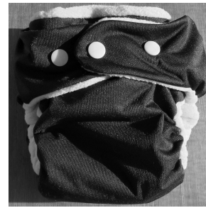
All made with the same pattern, with a different choice of colours and fabrics to give a unique nappy.